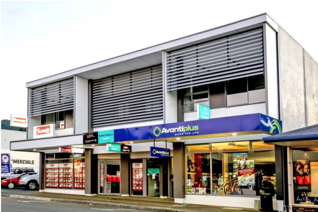
203 Queen St (Summit)