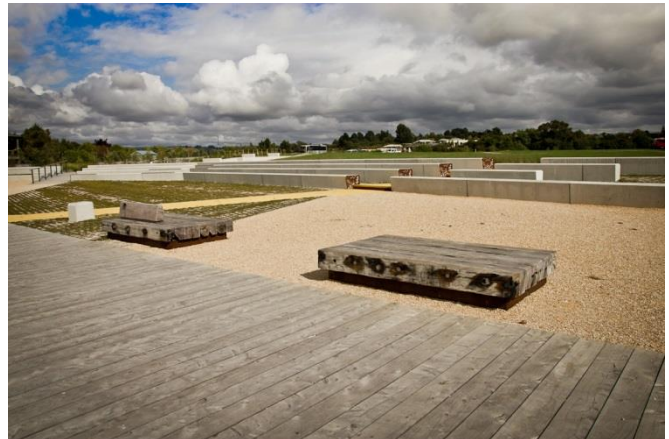
Mapua Water front/ boardwalk