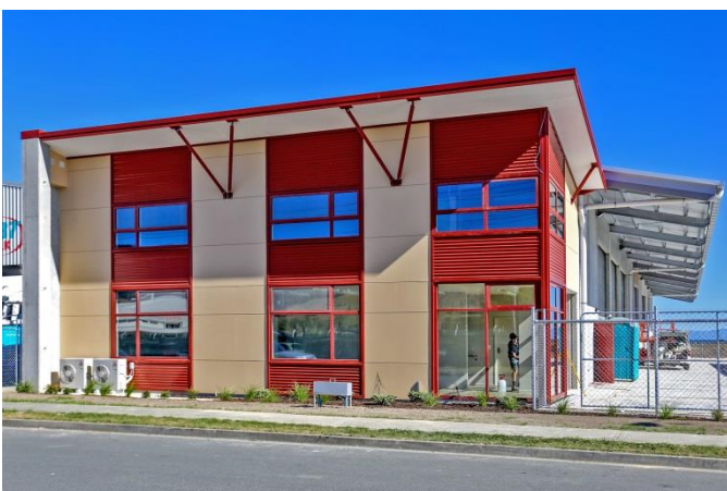
Pics Peanut Butter